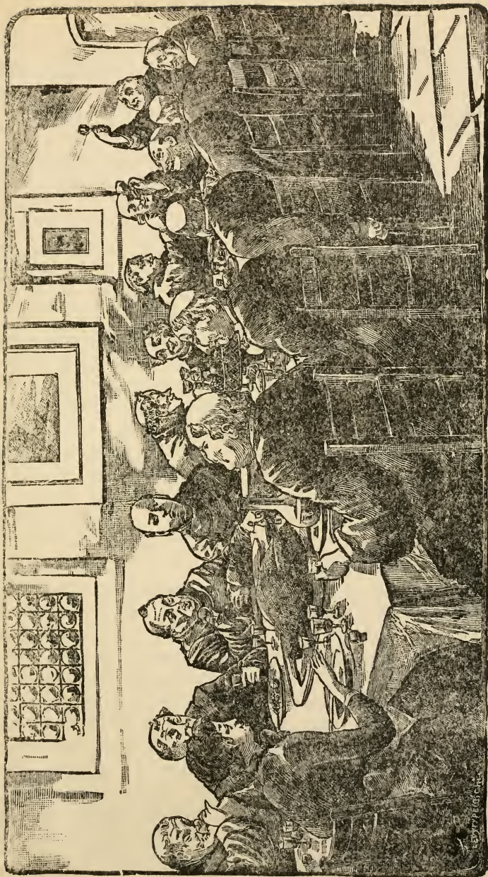
GRAND DINNER OF THE PRIESTS.