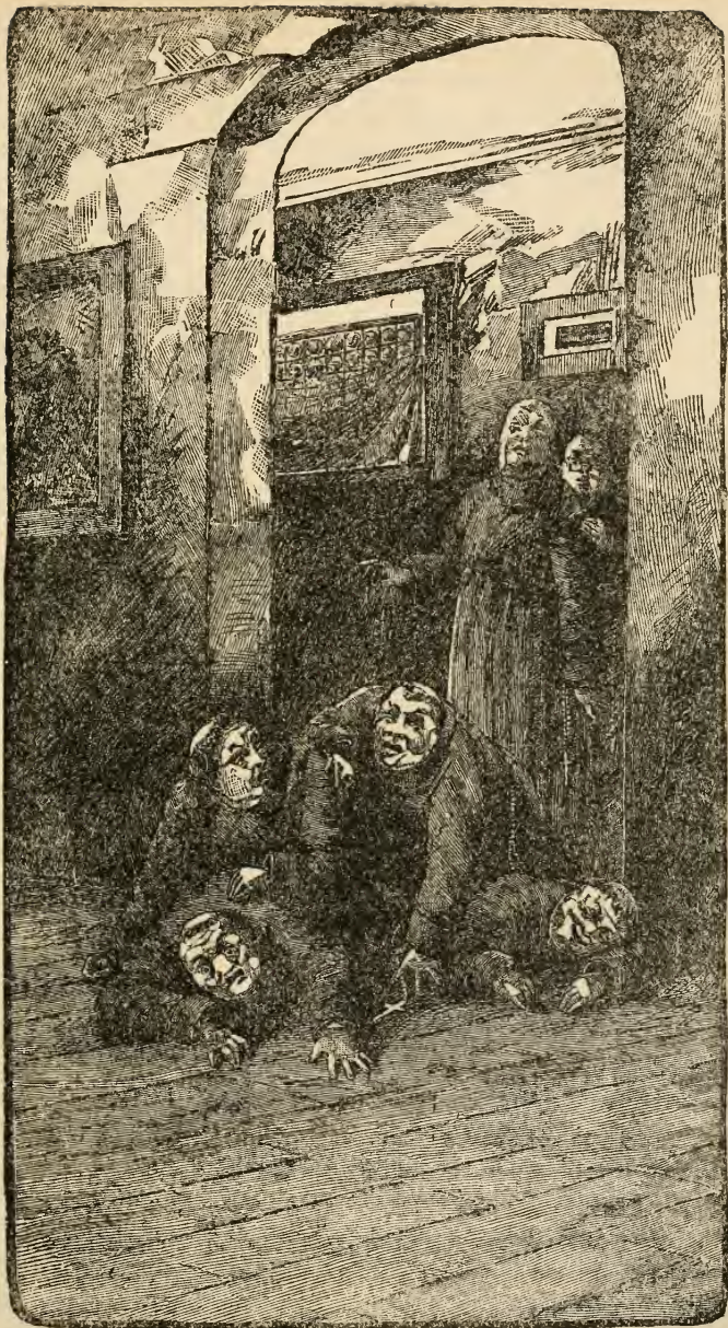
HALL OF THE "HOLY FATHERS."